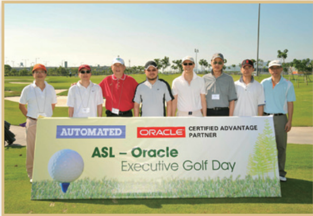
ASL - Oracle Executive Golf Day 自動系統與Oracle尊貴客戶高爾夫球日