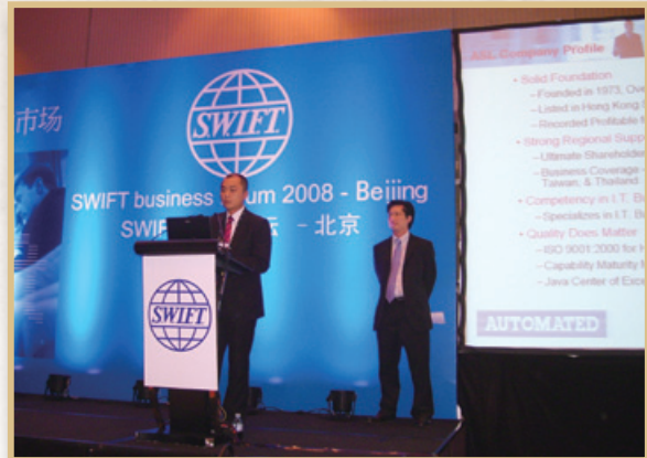
ASL introduces SWIFT related services to customers in mainland China 自動系統向中國大陸客戶介紹自動系統可提供SWIFT的服務

ASL Macau organizes "Ready IT Infrastructure for the Blooming Economy" seminar 自動系統的澳門公司舉辦「優化IT基建，迎接極速經濟發展」研討會