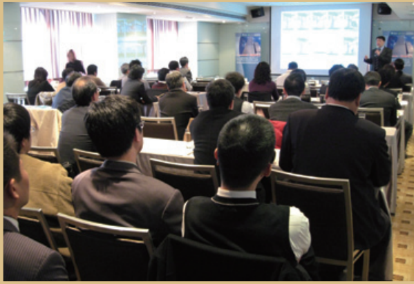
ASL Taiwan introduces high performance data warehousing solution to enterprises 自動系統的台灣公司為企業引進高性能資料倉儲解決方案