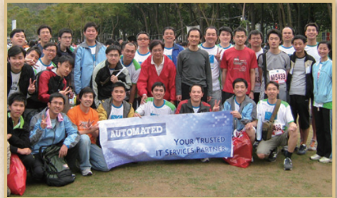
4 th consecutive patronage of the “Standard Chartered Hong Kong Marathon Corporate Challenge” shows ASL’s community involvement 連續四年支持「渣打馬拉松工商盃籌款活動」足證自動系統熱心公益