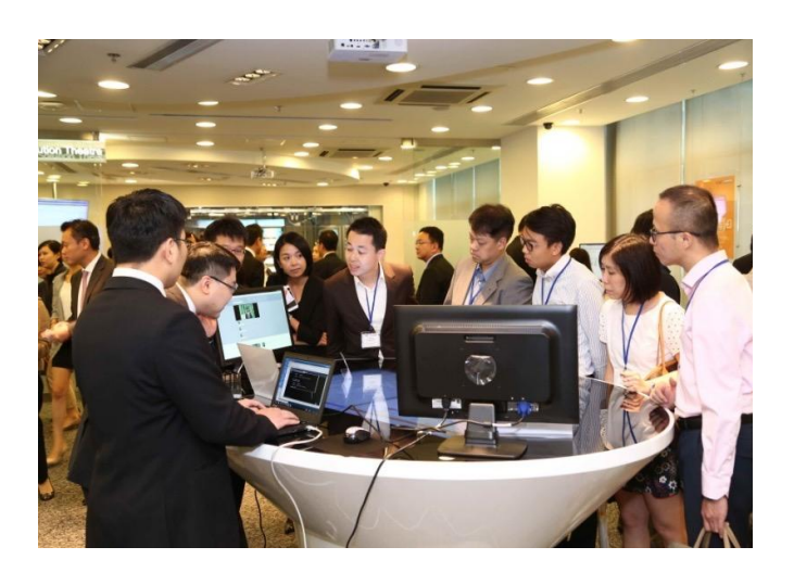
Guests are introduced to ASL's security solution during a live demonstration.